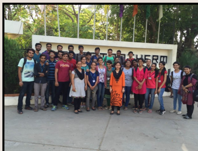
EC 6th sem. Electrotherm Pvt. Ltd.