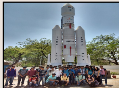
EE 2nd sem. ISRO