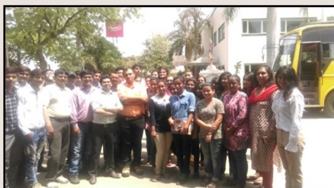
MBA, BBA Ramdev Masala Pvt. Ltd.