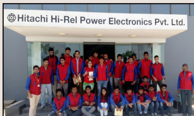
EEE 6th sem. Hitachi Hi-Rel Pvt. Ltd.