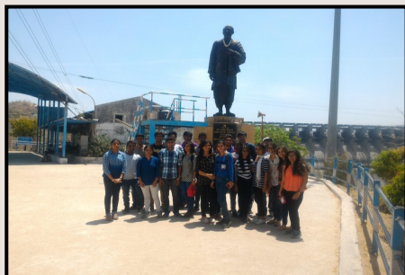
EC 4th sem. Sardar Sarovar Power Station